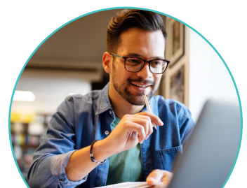
E-Learning: Self-paced Training