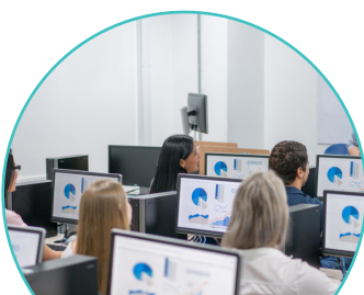
In class Training