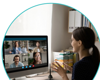
Online Instructor-led Training